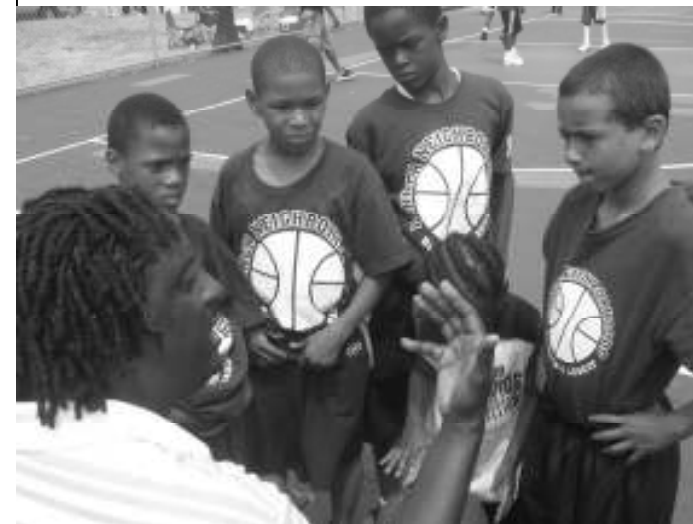
Youth players strategize with their volunteer coach

Banner's Youth Basketball League is starting soon! The league accepts boys and girls between the ages of 8 and 13. The season begins in March and ends in June, with practice one night a week and games every Saturday at William Paca Elementary/Middle. We need adult volunteer coaches! For a time commitment of 2 hours a week, you can make a big difference in the lives of young people in the neighborhood. Even if you have never coached or don't know much about basketball, you can be a big help just by showing up and helping other coaches. If you're interested in coaching or if you know young people who like basketball, please contact us at (410) 585 - 8810, or by email at info@bannerneighborhoods.org