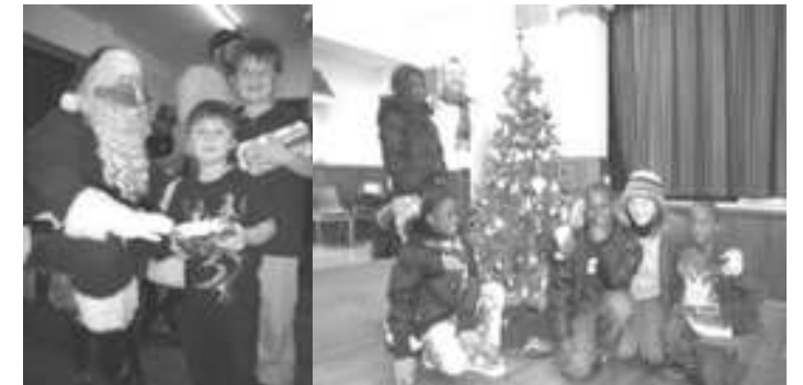
Kids and Adults were joined by Santa at the PPNA Holiday Party, with gifts and sweet treats galore!